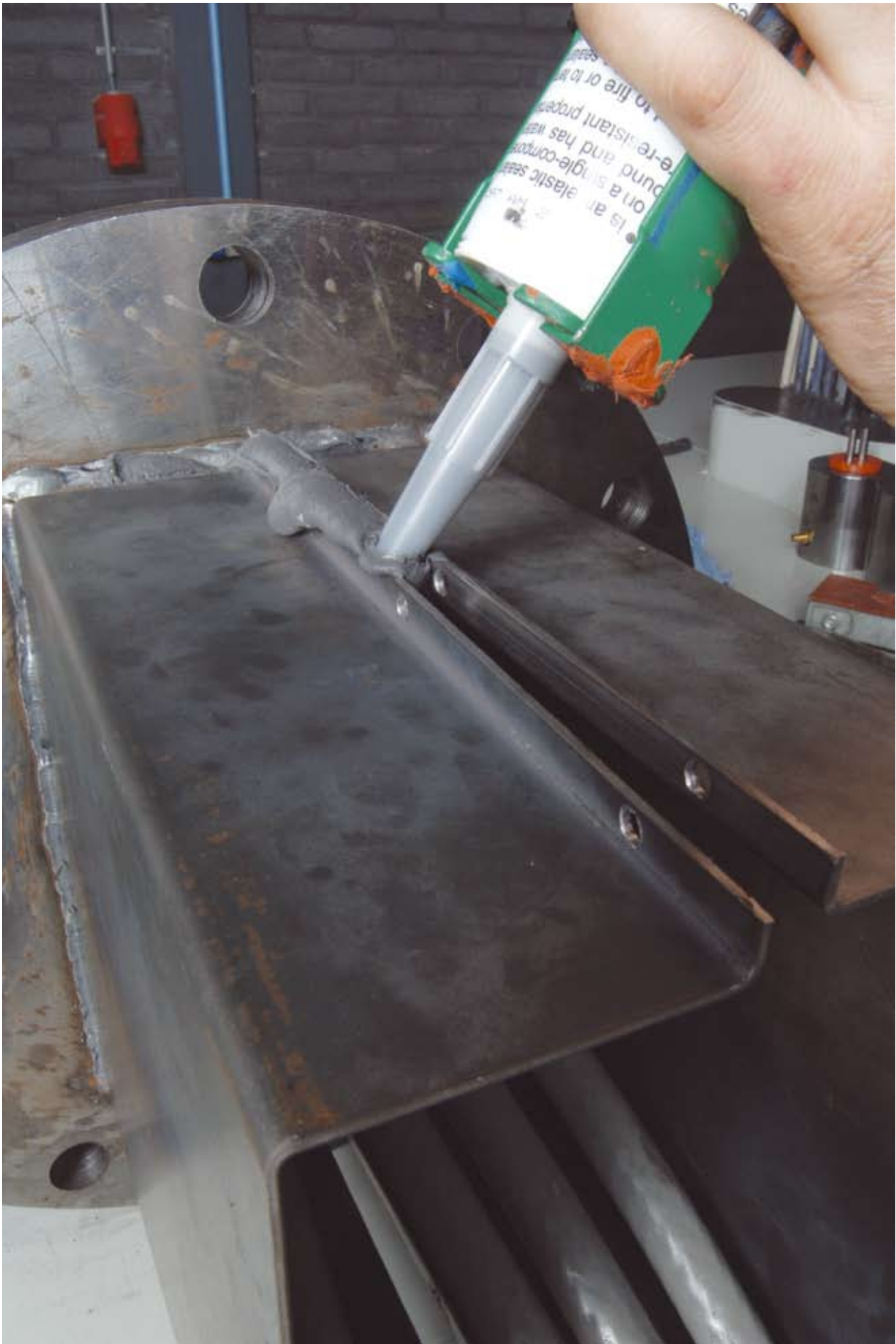
FIWA is applied between the flanges of both parts of the extender frame.