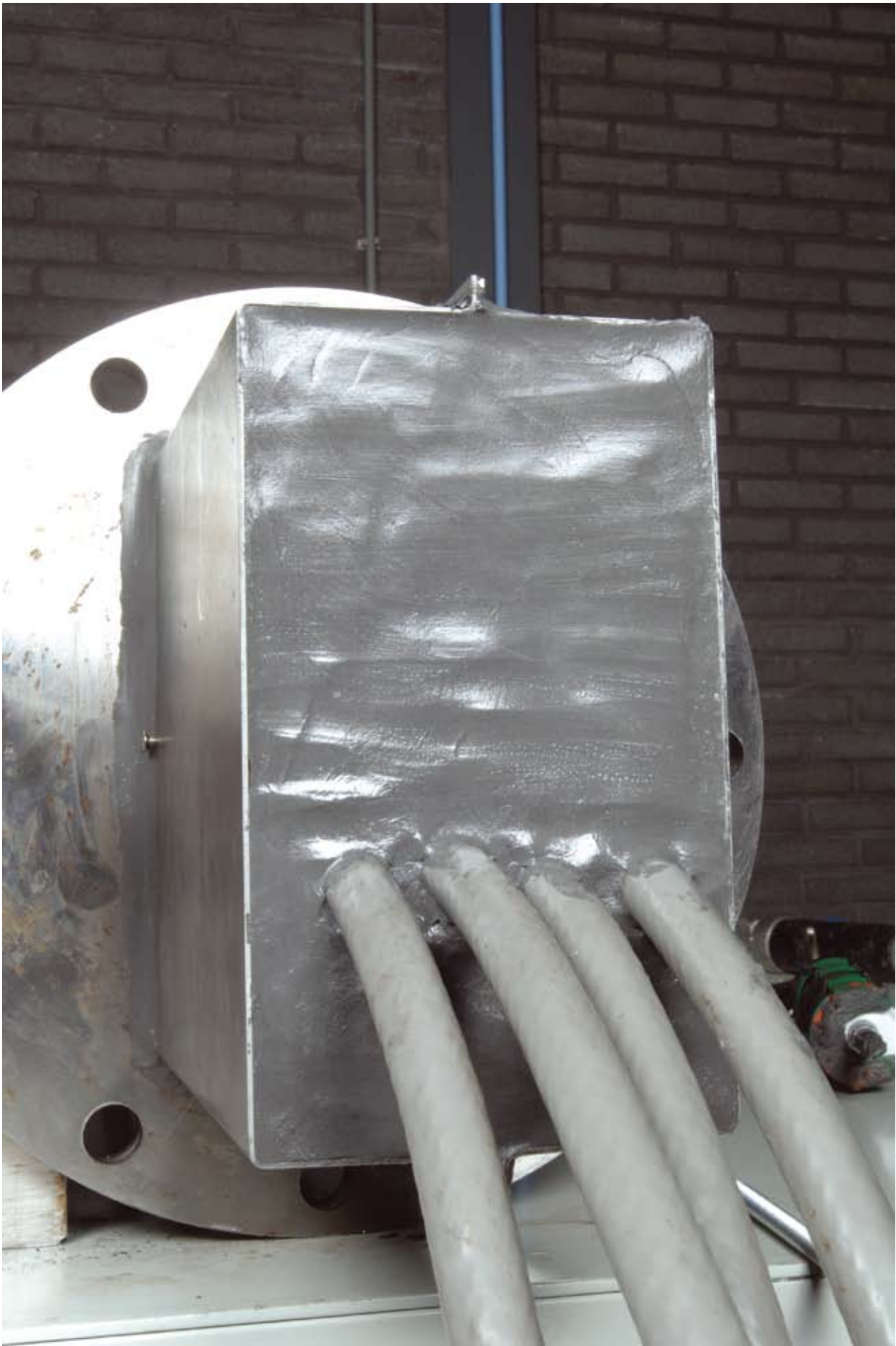
the installation is finished.