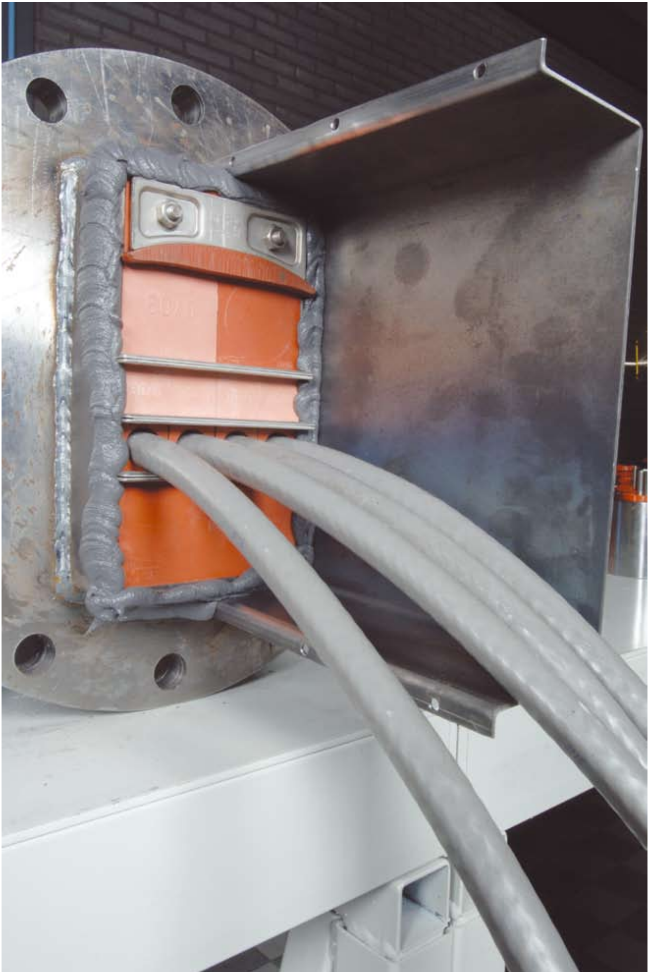
Positioning one part of the extender frame. Note that also the inside of the extender frame parts should be cleaned to obtain optimum adhesion with the sealant.